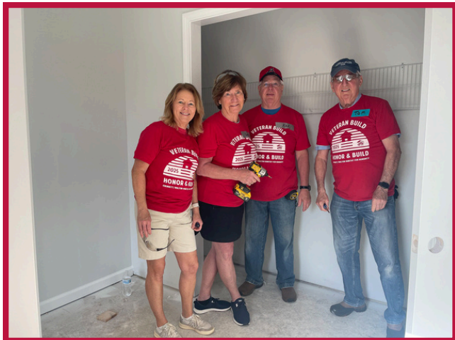
CEMSF volunteers working on a Habitat for Humanity home for veteran and his young daughter

In 2025, we supported 23 North Georgia veterans with direct assistance for essential needs including car repairs, utility bills, emergency housing, essential home repairs, Christmas gifts, and more — helping prevent veterans from falling through the cracks during times of need.